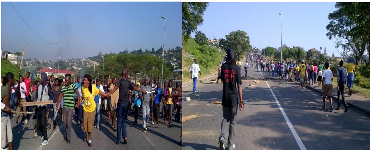
Plate 3: Residents gather for protest march