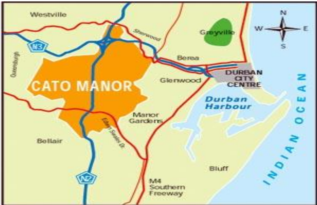
Figure 1: Map of the Study Area