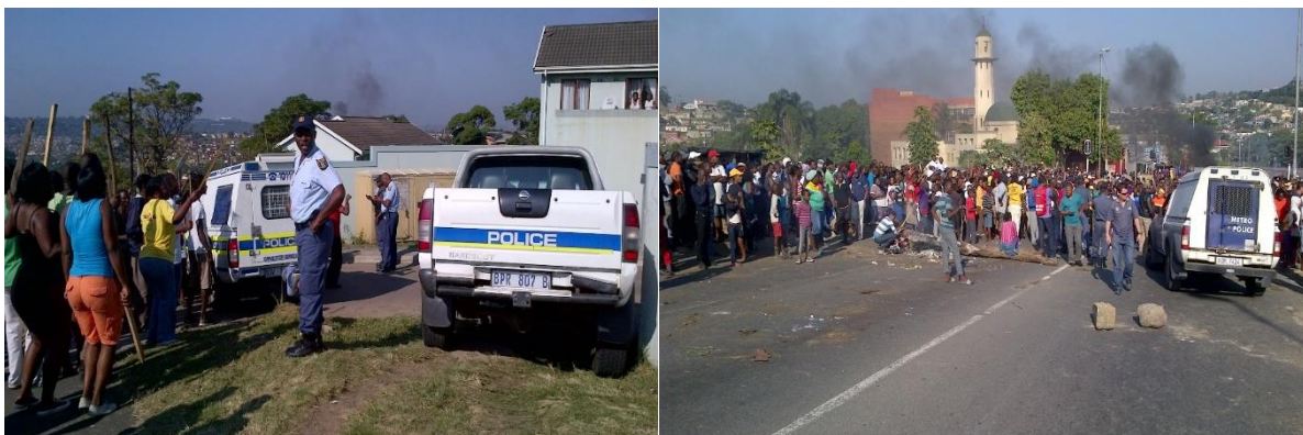
Plate 4: Confrontation between residents and police