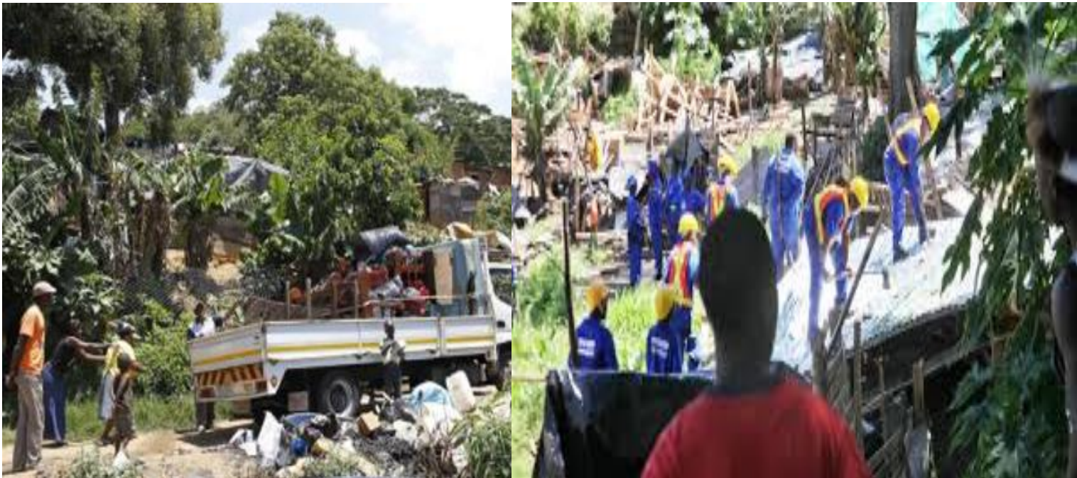
Plate 1: Evictions in Cato Crest without court orders

In January 2012 the planned demolition of shacks sparked violent protest in Cato Crest when the residents were told to leave their shacks so that new low-cost housing could be built (Plate 1). This particular set of demolitions became a political issue with the Democratic Alliance (DA) claiming that the ANC had ordered the illegal demolition of the shacks. This did, however, succeed in halting the demolitions as the DA opened up a case of illegal eviction at the Cato Manor police station. It was alleged that the shacks had been demolished without a court order (Hans, 2012).