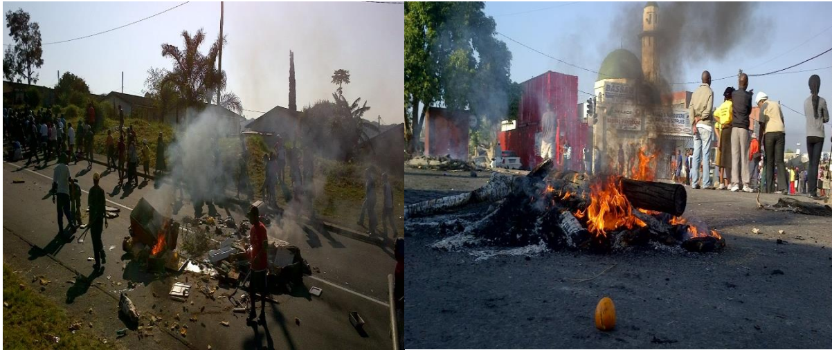
Plate 3: Blocking roads with burning tyres